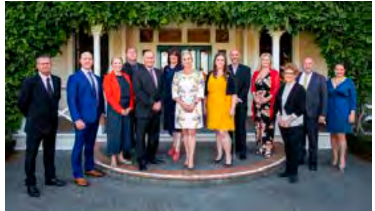
2019-2022 Napier City Councillors and Mayor