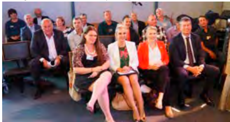
Napier City Council hopeful candidates waiting their turn to speak at the October meeting.

SEPTEMBER: An audience of over 300 welcomed 22 Napier City Council candidates, including three vying for the Mayoralty. Each candidate was given 3 minutes to speak, starting with the Mayoral and progressing to the candidates in the various council wards. As expected fresh, clean, unchlorinated water was the "hot topic" followed by the Aquatic Centre debate. All agreed that the water network needed a major overhaul so that the citizens of Napier could once again enjoy safe clean water. Division showed over the pool site – Prebensen Drive vs an Onekawa Pool upgrade. Strengthening the library building and moving back to the central city site; plus environmental and social