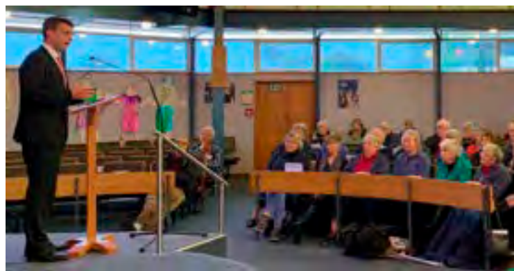
ACT MP David Seymour addressing our October meeting on the End of Life Choices Bill.

Stop Press: the final reading of the Bill was Wednesday, 13 November when it was agreed 69 for 51 against.