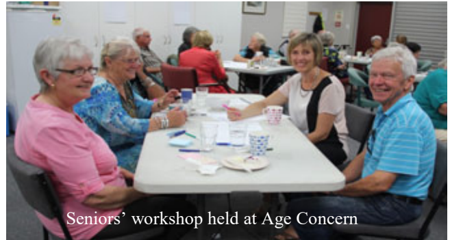
Seniors' workshop held at Age Concern