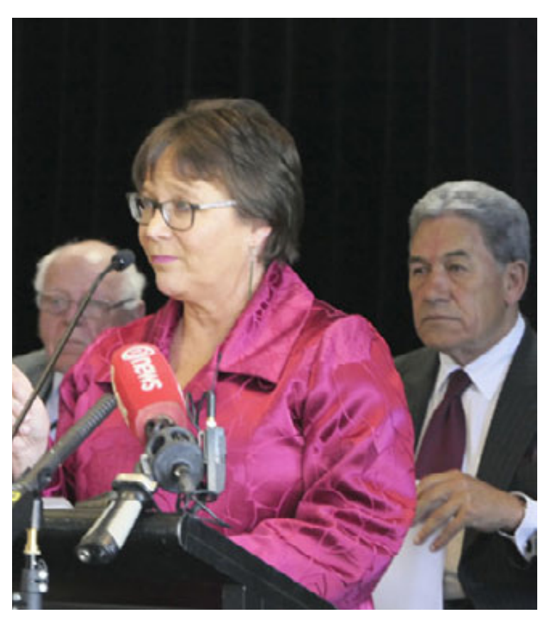
Minister for Seniors, Tracey Martin with Deputy Prime Minister Winston Peters at the Grey Power Federation's Conference.