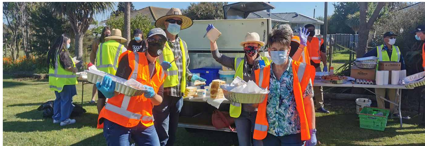
Community helpers at Pukemokimoki Marae on Super Saturday