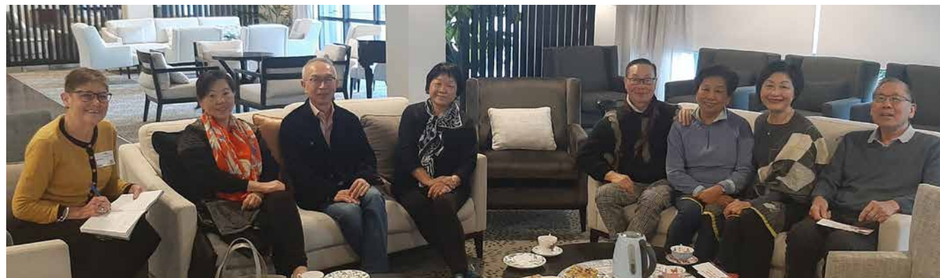
editorial supplied by Retirement Villages Assn.