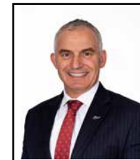
by Stuart Nash MP

I wonder if "Mask it or Casket" might work?