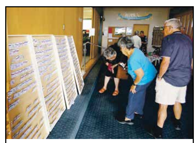
Like a treasure hunt – members looking for their name tag before our last meeting.

They are also looking for volunteer advocates to train.