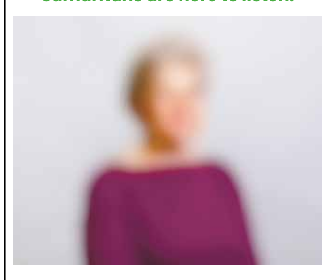
Samaritans listen without judgement, available 24/7, so that no-one in New Zealand ever has to feel alone when dealing with life's challenges.