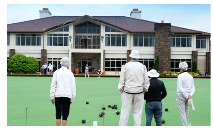
Editorial supplied by Retirement Villages Association

66% reported a greater sense of security and confidence, one third said they enjoy better physical health, and a satisfactory 67% said their social life had improved. So we can tick all those boxes!