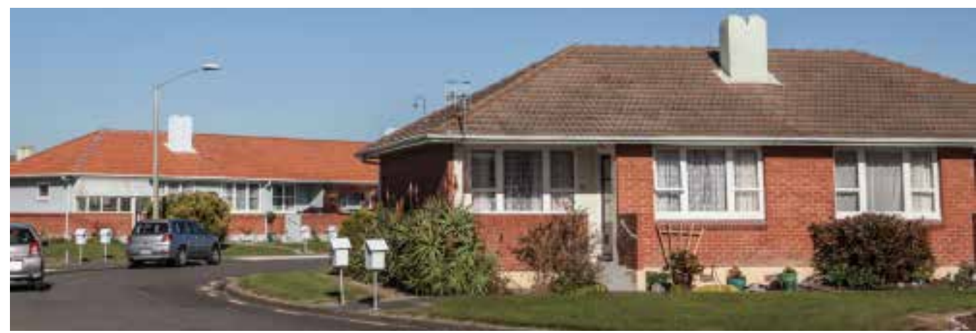
Henry Charles Village in Onekawa is one of the oldest in the Council portfolio

This also leaves open the option of a Hawke's Bay council housing trust being established or contracting an external provider to manage council-owned community housing properties.